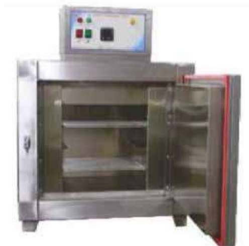
GMP Memmert! 3103 Model