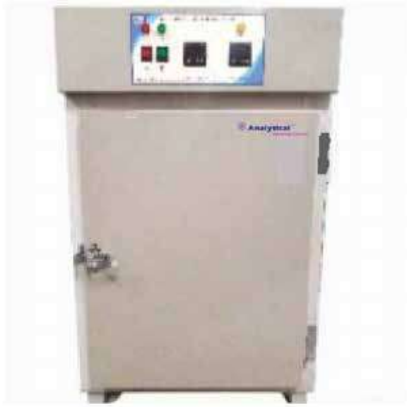
Precision 3102 Model