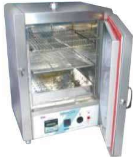
GMP Conventional 3101 Model