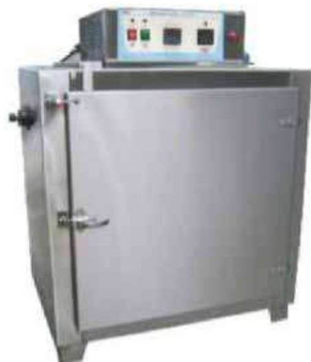
High Temp 3103 H